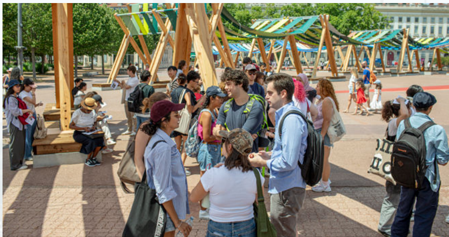
Made by : Direction of Communication UCLy - September 2025

The ILCF accompanies students during activities, but is not responsible for them.