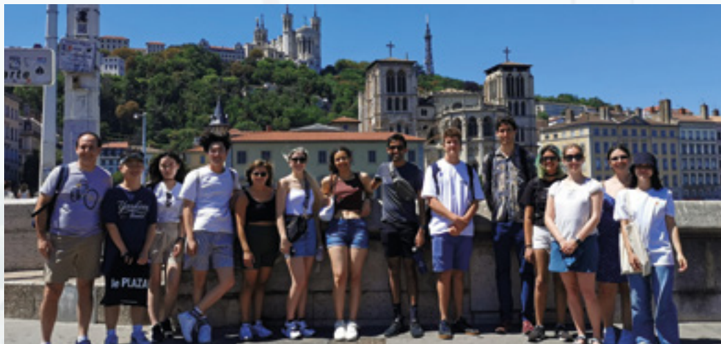
Made by : Direction de la communication UCLy - August 2025

The ILCF accompanies students during activities, but is not responsible for them.